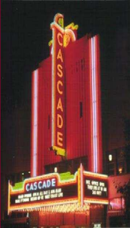
The Cascade Theatre in Redding, CA, 1731 Market Street

The wind of heaven is that which blows between a horse's ears. ~Arabian Proverb