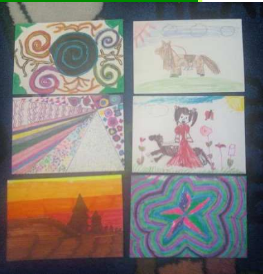
Some of the winning postcards from the contest

Congratulations to the winners of our Postcard Design Contest. Our office staff, Alturas teachers, and the Alturas Art Classes helped judge the contest.