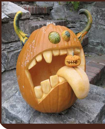
Pumpkin carving is it's own art form!

"You don't take a photograph, you MAKE it." ~ Ansel Adams Check out his photographs for inspiration!